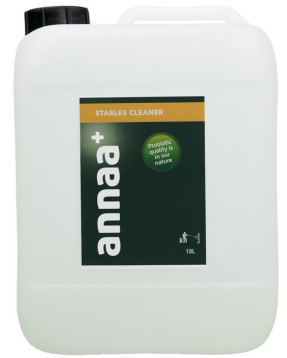
Screw Cap - 10 litres

The probiotics actively eliminate the odour molecules in organic waste, urine and manure that cause unpleasant animal odours. This improves air quality and reduces exposure to caustic urea and ammonia odour, reducing stress and the risk of pneumonia. They continue working for up to 3 days between applications.