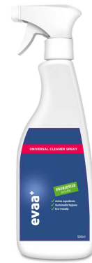
Empty Trigger Spray - 500ml