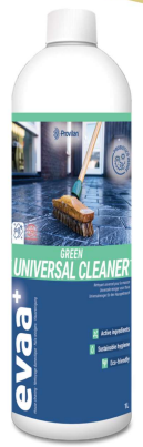
Concentrate - 1 litre, 5 litres, 25 litres